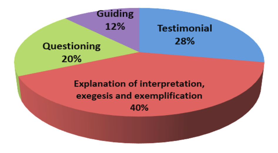
Diagram of the Expressive Structures of Aşbagh's Historical Reports